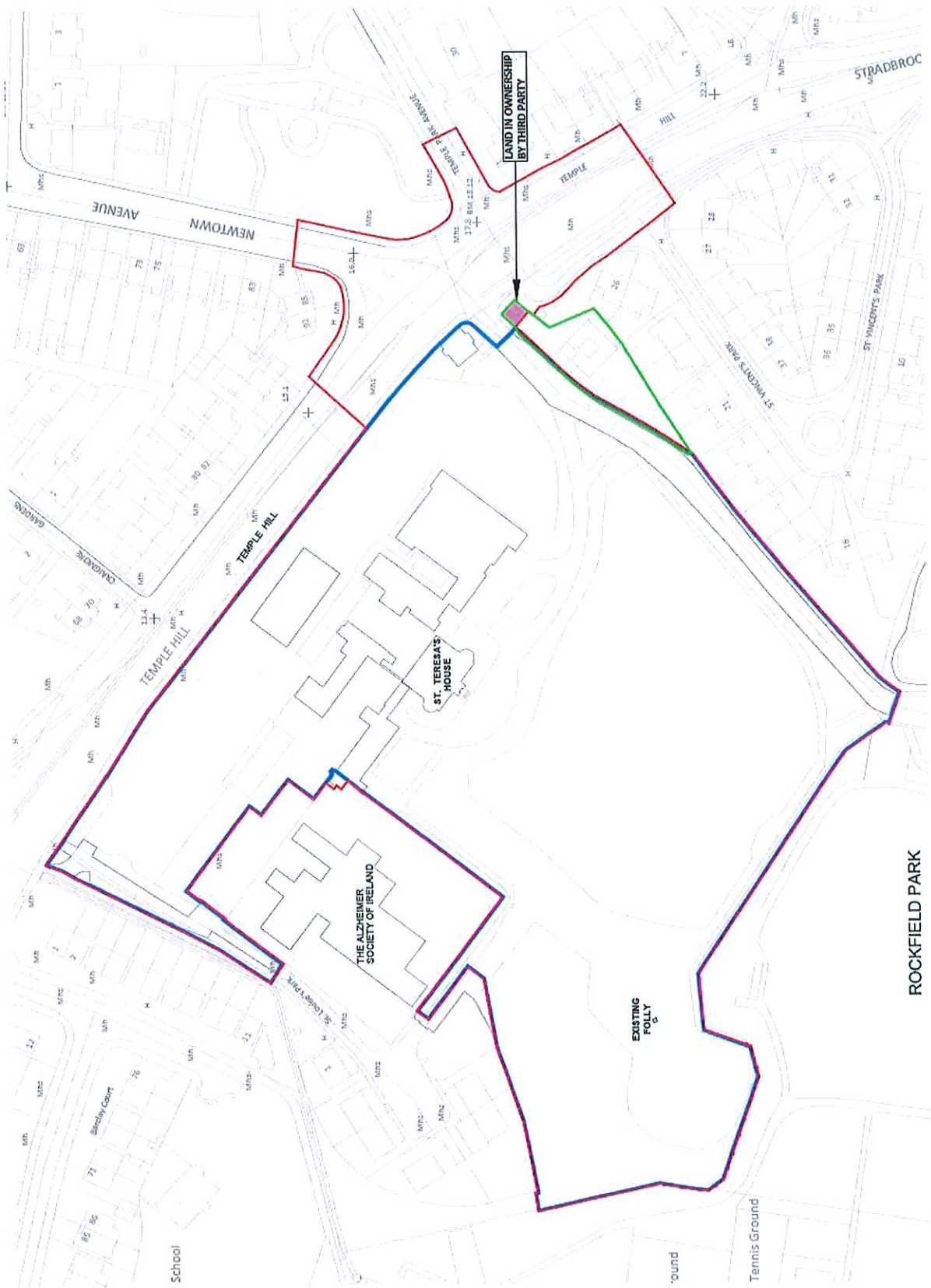
Map 1 The Property